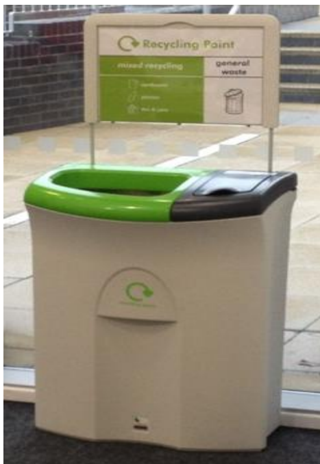
Twin bin system

A recycling programme does not necessarily have to be operated by the facilities management or another administrative department of a campus. Unlike other facility services such as building maintenance, or landscaping, many aspects of recycling operations do not require skilled labour. In addition, recycling operations are more wide ranging in scope, encompassing everything from emptying paper recycling bins at workstations to preparing training workshops for staff, faculty members and students.